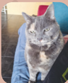
Teffy, Mount Pleasant