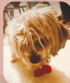
Dazi, North Glenmore Park