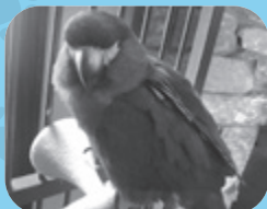
Echo, Nolan Hill