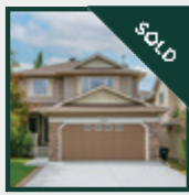
27 CRESTMONT DR SW