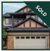
92 CRESTMONT DRIVE SW