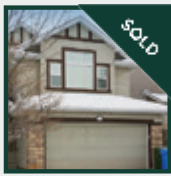
12 CRESTMONT DRIVE SW