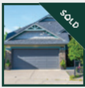
50 CRESTBROOK HILL SW