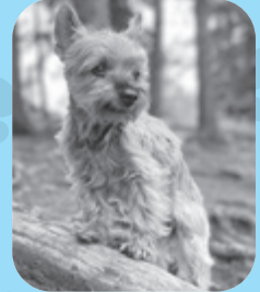
Pikko, Hillhurst Sunnyside