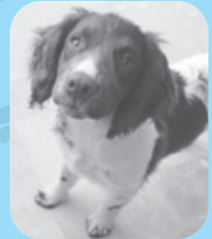
Tilly, Deer Run

To have your pet featured, email news@mycalgary.com