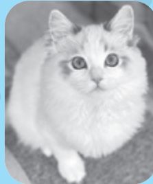
Snowbelle, Discovery Ridge