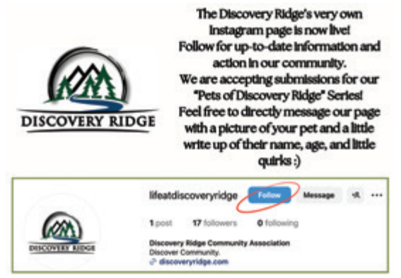
continued on next page

We are always looking for volunteers to help with the event – please contact volunteer@discoveryridge.com if you are interested in helping out.