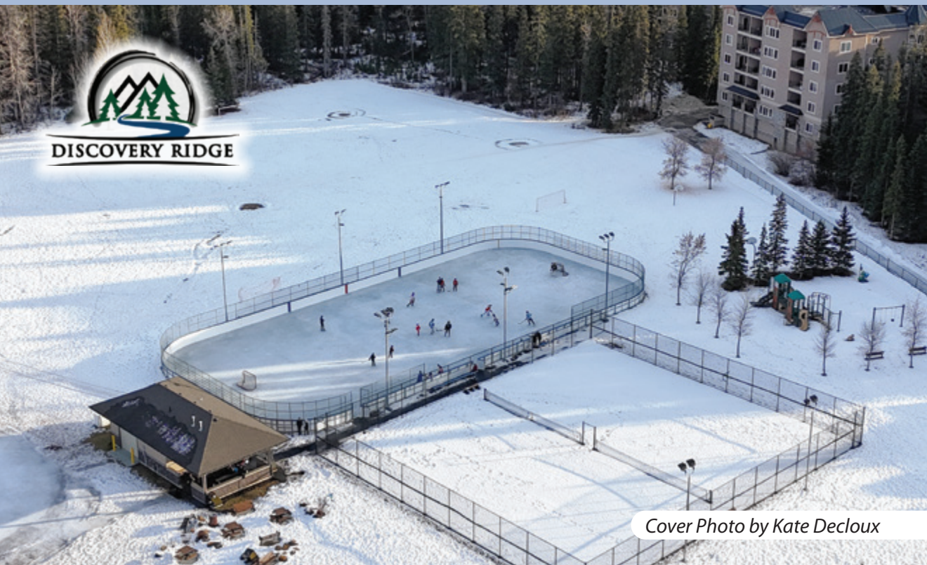
Cover Photo by Kate Decloux