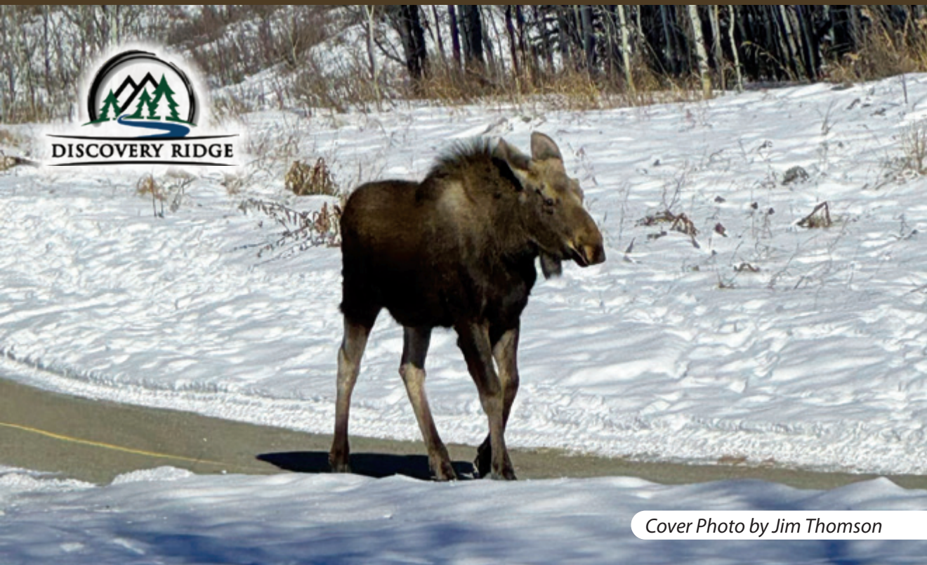
Cover Photo by Jim Thomson