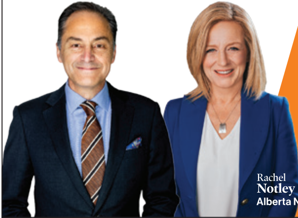
Rachel Notley Alberta NDP Leader