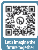
Let's imagine the future together