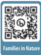
Families in Nature

We would like to create a Campfires Subcommittee, to help us deliver these events in collaboration with our Events Committee. Please contact us to learn more about how you can support these much-loved events.