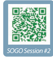
SOGO Session #2