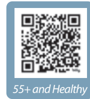
55+ and Healthy

For questions or to volunteer, please email seniors@yourseca.ca . Register at the QR code below.