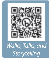
Walks, Talks, and Storytelling

These programs are a time to share what we love about our community and dream about how to make our shared spaces even better. If you loved the SECA Chairs last fall, help us imagine what could come next. As a resident, what do you need or dream about in our area to create a stronger, more welcoming, healthy, and more vibrant community? Our creative approach will be a fun, participative way of exploring our community on foot, talking about what we observed, and learning how to share emerging ideas in compelling ways.