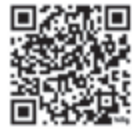
55+ Healthy and Happy Program

SECA's AGM is more than a business meeting — it's a chance to celebrate what we've achieved together and look ahead to the exciting work still to come. We'll kick things off with light refreshments and social time, followed by our Report to the Community and the official business portion of the meeting, where we'll elect new board members and share what's next for SECA. Guest speakers will inform and inspire us.