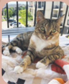
Willow, McKenzie Towne

To have your pet featured, email news@mycalgary.com