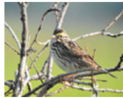
A Savannah Sparrow with the yellow streak over the eye.

Now you have a good foundation to pick out two of the brown streaky birds flying around Calgary. It’s true they are difficult to tell apart visually, we usually use song and context to help us out. Remember while you are watching the birds, they watch you too. They probably can’t tell you apart from the next person either.