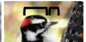
Downy Woodpecker: the beak is half the size of the head.