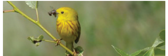
A Yellow Warbler helpfully reducing the number of insects.

The Yellow Warbler makes little cup nests that are often stolen by the famously parasitic cowbird. When this happens, the warbler will build a new nest on top of the old one, sometimes resulting in layers of nests. I don't think there are many cowbirds in Weaslehead, thankfully for the Yellow Warbler.