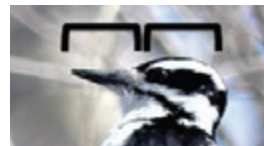
Hairy Woodpecker: the beak is the same size as the head.

After I wrote my article on Downy vs. Hairy Woodpeckers, I saw a great article about them on the Cornell Ornithology website. The best way to tell them apart is to look at the relative size of their beak compared to their head. This way you don't have to create an imaginary bird beside them! All the information is right in front of you.