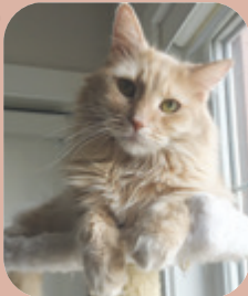
Harper Lee, Beddington