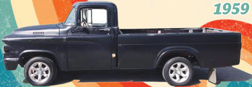
1959 Dodge D-100