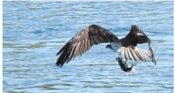
The fishing machine at work.

athletic shorts which acted more as a flag, hanging from the bottom. Perhaps for their favourite team? This year it looks like they are making use of a rope and an unidentified piece of cloth. I couldn't really tell with all the sticks and extras making up its nest, but it looked like there was no actual nesting platform for this pair. It brings up the question of why the Ospreys don't like the very sturdy nest platforms in Weaslehead. I have never seen an Osprey nest on those in all the years they have been there. Perhaps it is about the fishing opportunities down there? Maybe we need to organize some sporting events for them to watch.