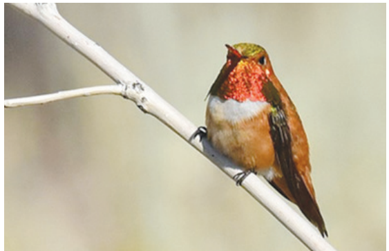
A male Rufous Hummingbird aka "Mr. Feisty."

I hope you had a chance to see this small bird with an outside personality this summer!