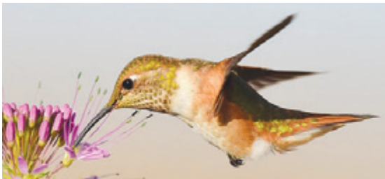
A female or immature male Rufous.

These tough little birds travel up to 3,000 miles during migration. All the way from Southern Mexico to Alaska, so far for a tiny bird, maybe it can just soar on the winds. It doesn't seem to be the type to let the wind do all the work though, the one I saw was constantly beating its wings while flying. According to "All About Birds" they fly up through California, then Washington and BC. After that they go east and fly down the Rockies, completing a clockwise circle. So, they will come through Calgary on their way south, especially during August.