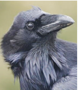
A close up of a raven's neck feathers and intelligent eyes.