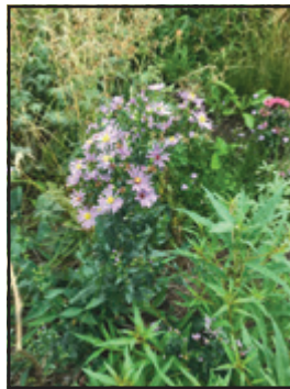
Smooth asters. So close to being composted, by accident.