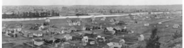
"Panoramic view of Sunnyside district, Calgary, Alberta," 1911, (CU183161) by Unknown. Courtesy of Libraries and Cultural Resources Digital Collections, University of Calgary. https://digitalcollections.ucalgary.ca/asset-management/2R3BF1OWLXGR?WS=PackagePres .