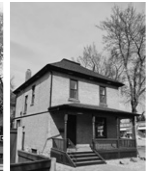
Brower House, April 2023.