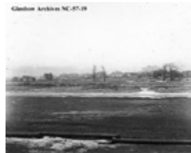
"Memorial Drive, Calgary, Alberta," [ca. 1912], (CU173515) by Unknown. Courtesy of Libraries and Cultural Resources Digital Collections, University of Calgary. https://digitalcollections.ucalgary.ca/asset-management/2R3BF1S14VF9 .