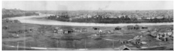
"Panoramic view of Sunnyside district, Calgary, Alberta," 1911, (CU183159) by Unknown. Courtesy of Libraries and Cultural Resources Digital Collections, University of Calgary. https://digitalcollections.ucalgary.ca/asset-management/2R3BF1OWLXGQ?WS=PackagePres .

The House was spared destruction when the CTrain's "Northwest Line" was built in 1987. In 1993, it was sold by the family. Today, Brower House is a Calgary Heritage Award-winning office space redevelopment. It's no longer a home (and has no official heritage protection), but it retains its charm and history as one of Calgary's early residences.