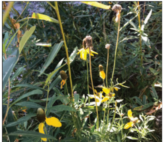
Amongst the tall fireweed ( Chamaenerion angustifolium ), yellow cone-flowers ( Ratibida columnifera ). This is their second year; finally showing flowers.