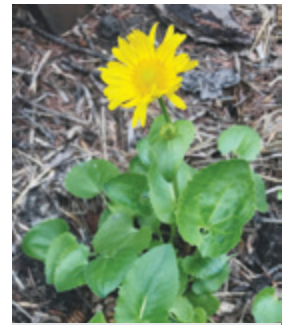
The yellow leopard's bane daisy is such a cheerful addition in a garden.