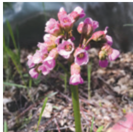
This lovely pink umbel is one of the early flowering bergenia. An old fashioned, but lovely addition to any yard.

Thanks mom, your plants will remind me of you and wonderful memories of gardening and growing up.