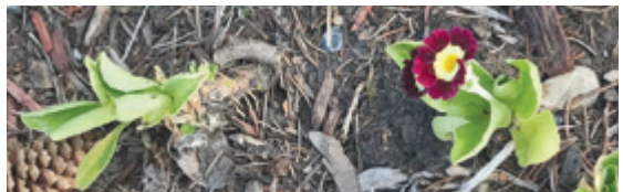
You've all seen this kind of primula. It's super hardy and will brighten a spring day.