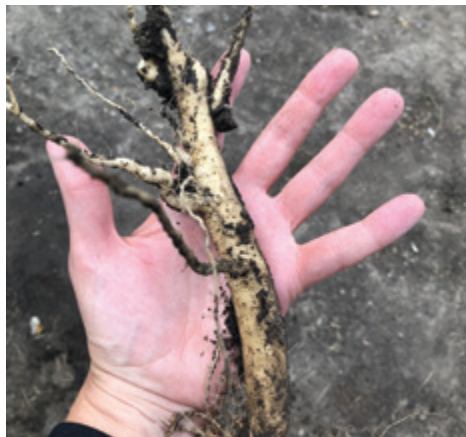
The infernal root of a purple creeping bellflower. Nicely, and totally dug up at Mike and Jenn Meredith's place. A win!