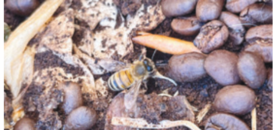
A honeybee, out and about in March.