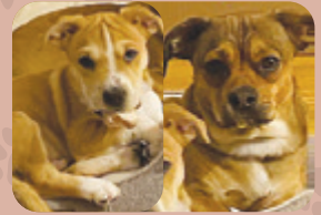
Tucker and Bentley, McKenzie Towne

To have your pet featured, email news@mycalgary.com