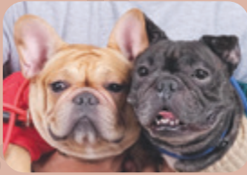
Basha and Molly, Elbow Scene