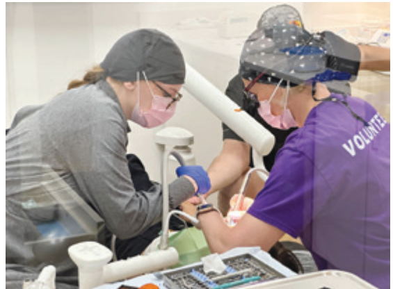
Le Family Dental in action on Neighbour Day 2024 providing free cleanings to community members! It was an exciting and busy day.

The Board is also in conversations with Le Family Dental to bring more information to the community about oral health! Stay tuned for information sessions at the hall and other events and opportunities. Le Family Dental is passionate about promoting oral wellness and wanted to make sure that everyone knows that with the tax year approaching, it is very important for community members to file for their taxes so they can apply for Canadian Dental Care Plan (a federal dental benefit), if eligible. Seniors and children with household income under $90K currently qualify, but it is good to be ready in case this benefit is extended to other age groups as well. Check here for more information! canada.ca/en/services/benefits/dental/dental-care-plan/apply.html .