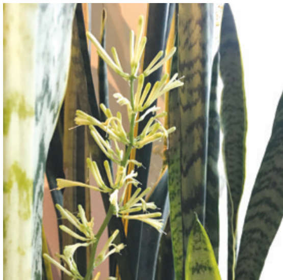
My snake plant, the tall version. Some of the leaves got to 1.5 m! In this photo (January 2018), it's in flower, which I found out is challenging for a house plant to do.

Contact Monika at naturallyglendale@myglendale.ca .