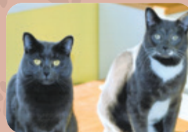
Sir Gawain and Sir Tristan, Woodbine

To have your pet featured, email news@mycalgary.com