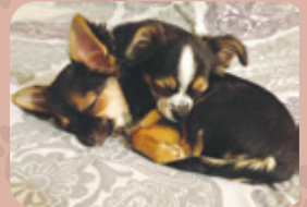
Tiger and Lily, Evanston

To have your pet featured, email news@mycalgary.com