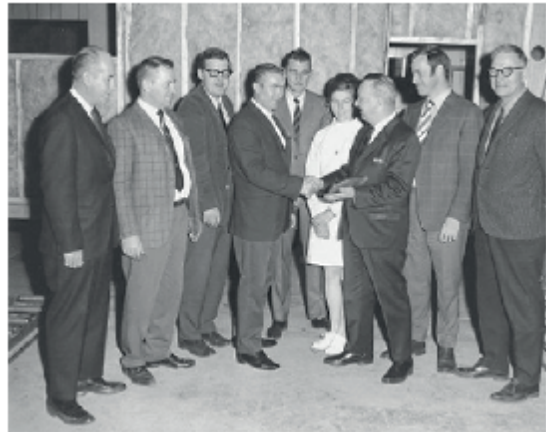
ATCO Manager presenting Safety Performance Awards to the Construction Division