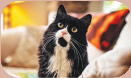
Tuxedo Joe, Cranston

To have your pet featured, email news@mycalgary.com