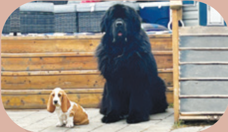
Baloo and Walter, Springbank Hill