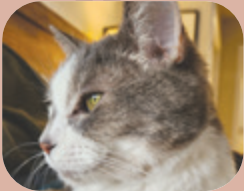
Squeeks, Mount Pleasant