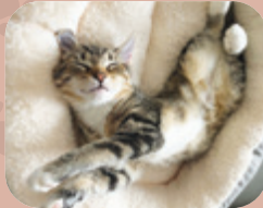
Ravioli, Lower Mount Royal