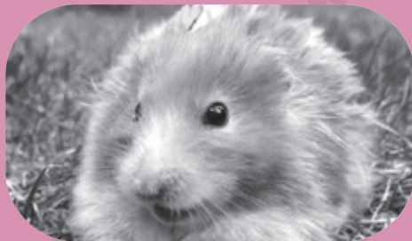
Biscuit, Deer Run