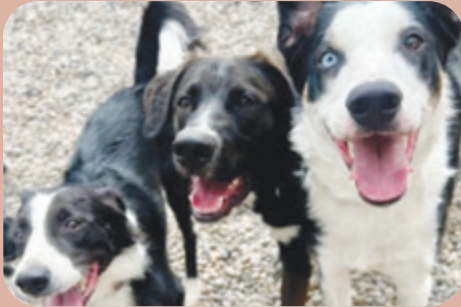
Bowser, Remus, Riku, Montgomery