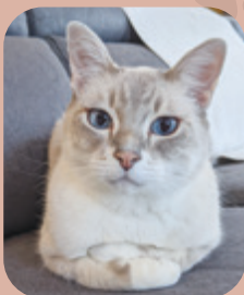
Tigger, Elbow Scene