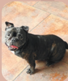
Molly, Elbow Scene