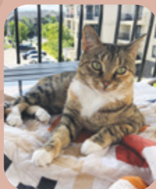
Willow, McKenzie Towne

To have your pet featured, email news@mycalgary.com