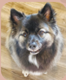
Roscoe, McKenzie Towne