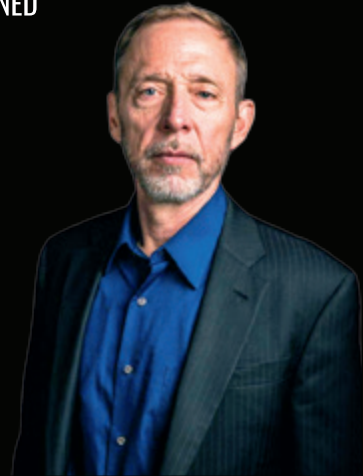
Former FBI hostage negotiator Chris Voss is the CEO and Founder of the Black Swan Group