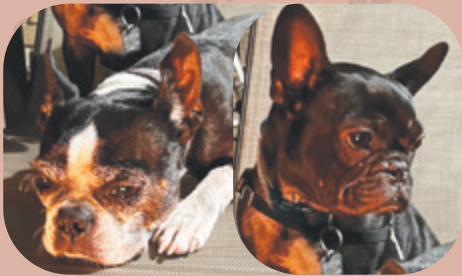
Tiffany and Maggie, Calgary

To have your pet featured, email news@mycalgary.com