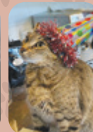
Sugar, Signal Hill