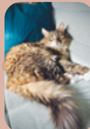
Guzel, Hunterson Place