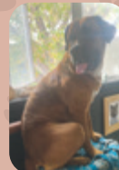
Poppy, Tuxedo Park