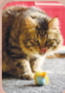
Dobby, Hunterson Place