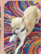
Todd, Lake Chaparral

To have your pet featured, email news@mycalgary.com