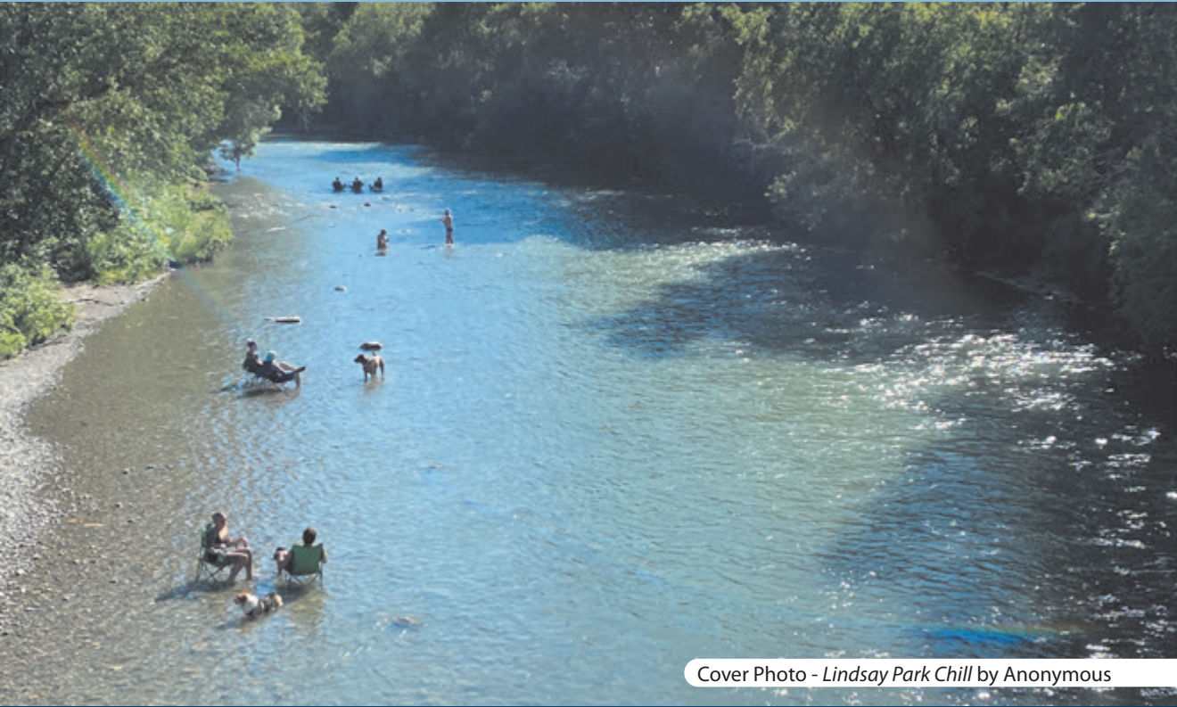
Cover Photo - Lindsay Park Chill by Anonymous

THE OFFICIAL NEWSLETTER OF THE CLIFF BUNGALOW - MISSION COMMUNITY ASSOCIATION