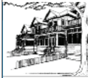
Cliff Bungalow-Mission Community Association