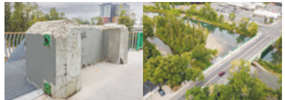
Mission Bridge

Here is the link to see a rendering of how the bridge will look and for more information about the project as it progresses: www.calgary.ca/planning/projects/mission-bridge.html .