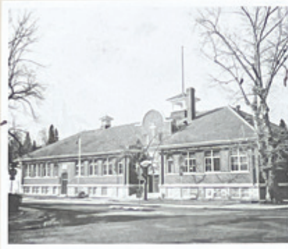
Holy Angels School