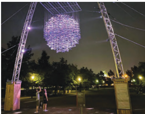
1000 Faces by Alejandro Figueroa

Renowned artist Alejandro Figueroa, winner of prestigious events like the VR contest at the Phi Center in 2016 and ArtWorkTO 2021, led the creation of this massive installation. Suspended on a 40-foot-high arch, it comprises 1,779 plexiglass tiles moving independently to mirror nature's rhythm. Canadian artist AMOR collaborated with Calgary-born artist Dillan (King Aurorus) to produce the original soundtrack that accompanies the sculpture. Figueroa says 1000 Faces showcases the transformative power of public art, blending contemporary creativity with nature's beauty and local cultural influences.