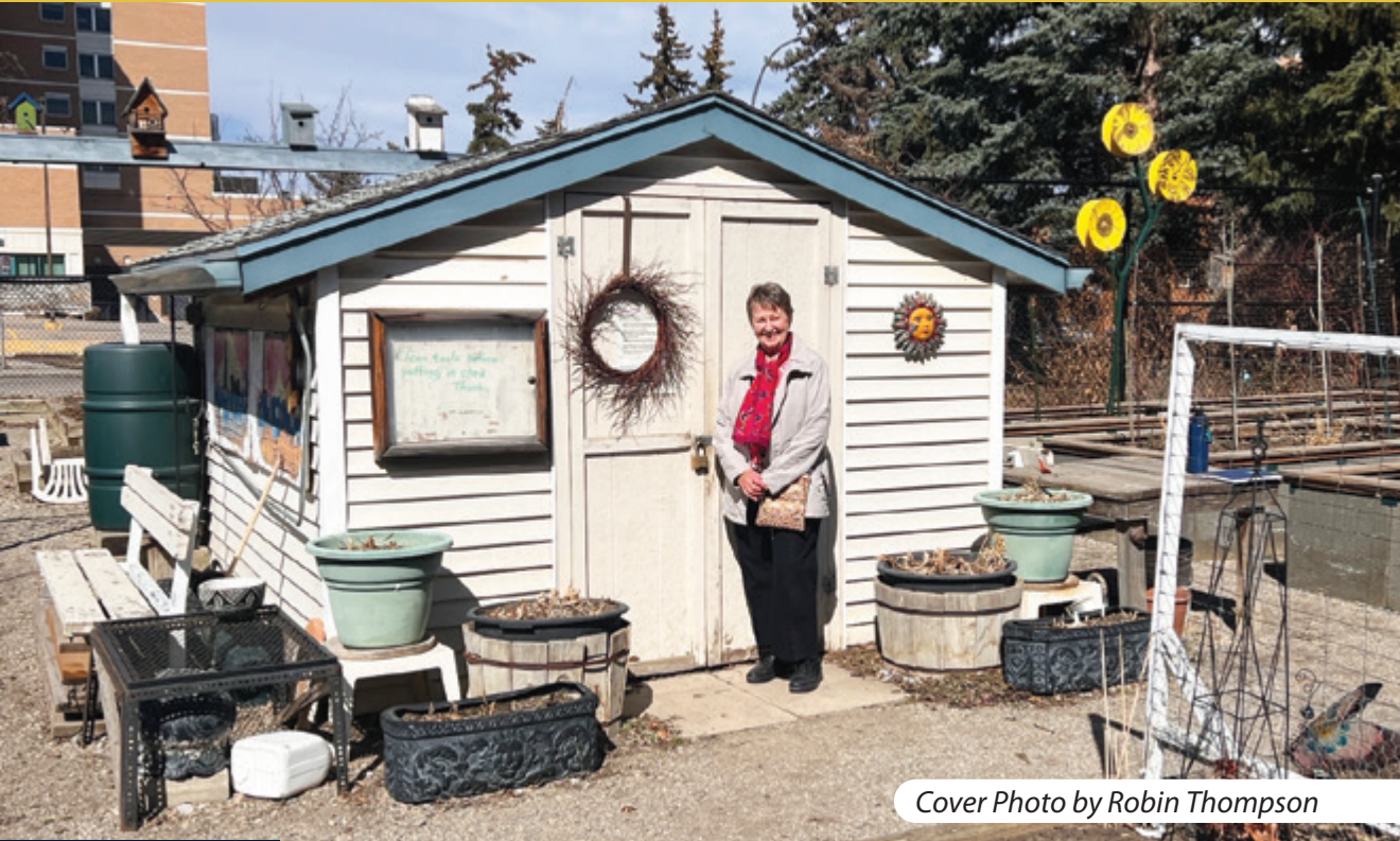
Cover Photo by Robin Thompson

THE OFFICIAL NEWSLETTER OF THE CLIFF BUNGALOW - MISSION COMMUNITY ASSOCIATION