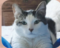
Starr, Lake Chaparral