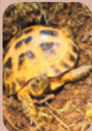
Dry Bones, McKenzie Lake