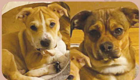
Tucker and Bentley, McKenzie Towne

To have your pet featured, email news@mycalgary.com