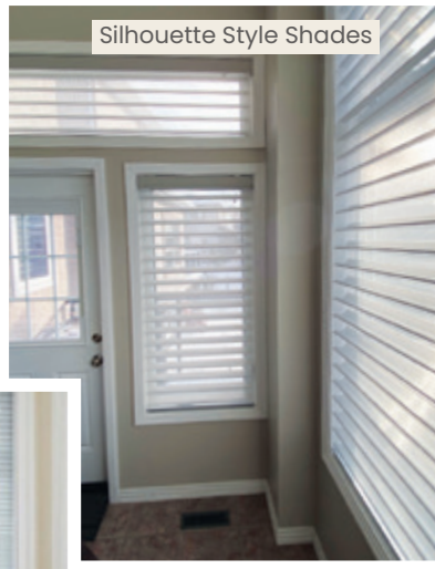
Silhouette Style Shades