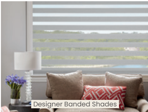
Designer Banded Shades