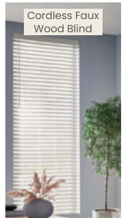
Cordless Faux Wood Blind