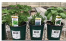
4" Herb Tray (12 per tray)