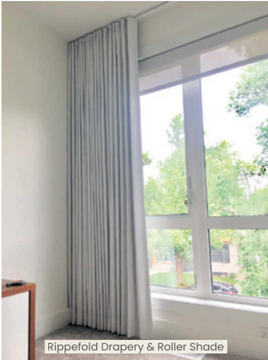
Rippefold Drapery & Roller Shade