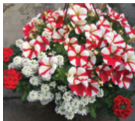
11" Premium Hanging Basket