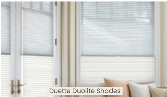
Duette Duolite Shades