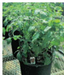
10" Tomato Planter with Cage