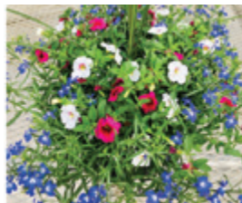
12" Premium Patio Planter

(or contact the community association for a paper form)