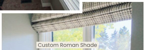
Custom Roman Shade