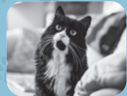
Tuxedo Joe, Cranston

To have your pet featured, email news@mycalgary.com