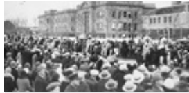
https://digitalcollections.ucalgary.ca/asset-management/2R3BF1OJNK83?WS=SearchResults. "First Nations parading on 7th Avenue at the Santa Claus parade, Calgary, Alberta.", 1931, (CU1107062) First Nations parading on 7 Avenue, Calgary, Alberta. At the Santa Claus parade. Courthouses and land titles building to rear.