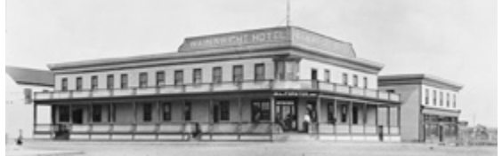
"Wainwright Hotel, Wainwright, Alberta.", [ca. 1911-1912], (CU1126598) The hotel burned down in 1929. A reconstruction is in Heritage Park, Calgary, Alberta. https://digitalcollections.ucalgary.ca/asset-management/2R3BF1FJKK33?WS=SearchResults.

*All copyright images cannot be shared without prior permission.