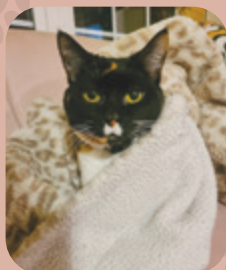
Icy, North Glenmore Park