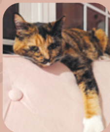
Millie, North Glenmore Park

To have your pet featured, email news@mycalgary.com