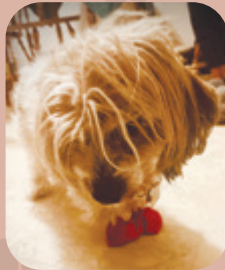
Dazi, North Glenmore Park