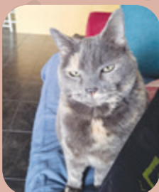
Teffy, Mount Pleasant