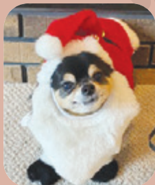
Pedro, Sandstone Valley