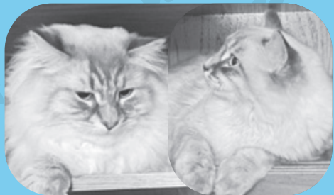
Spook and TenSoon, Crescent Heights

To have your pet featured, email news@mycalgary.com