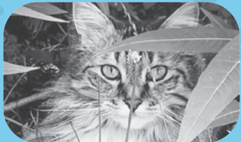
Luna, Canyon Meadows