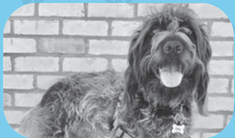
Otto, Crescent Heights